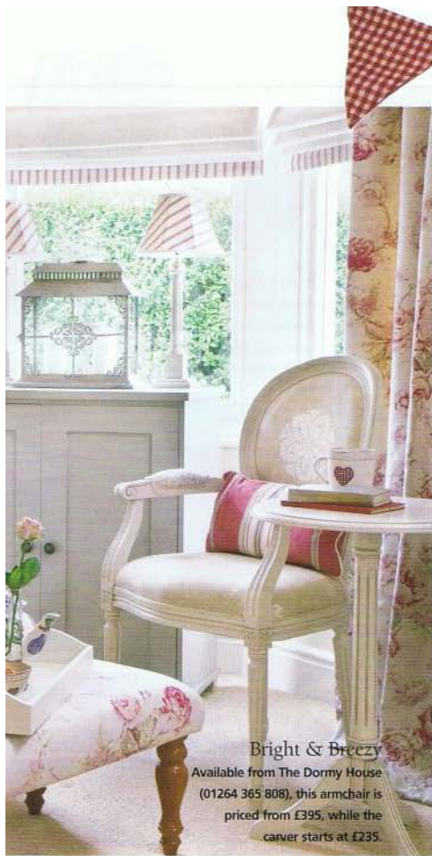
Bright & Breezy Available from The Dormy House (01264 365 808), this armchair is priced from £395, while the carver starts at £235.