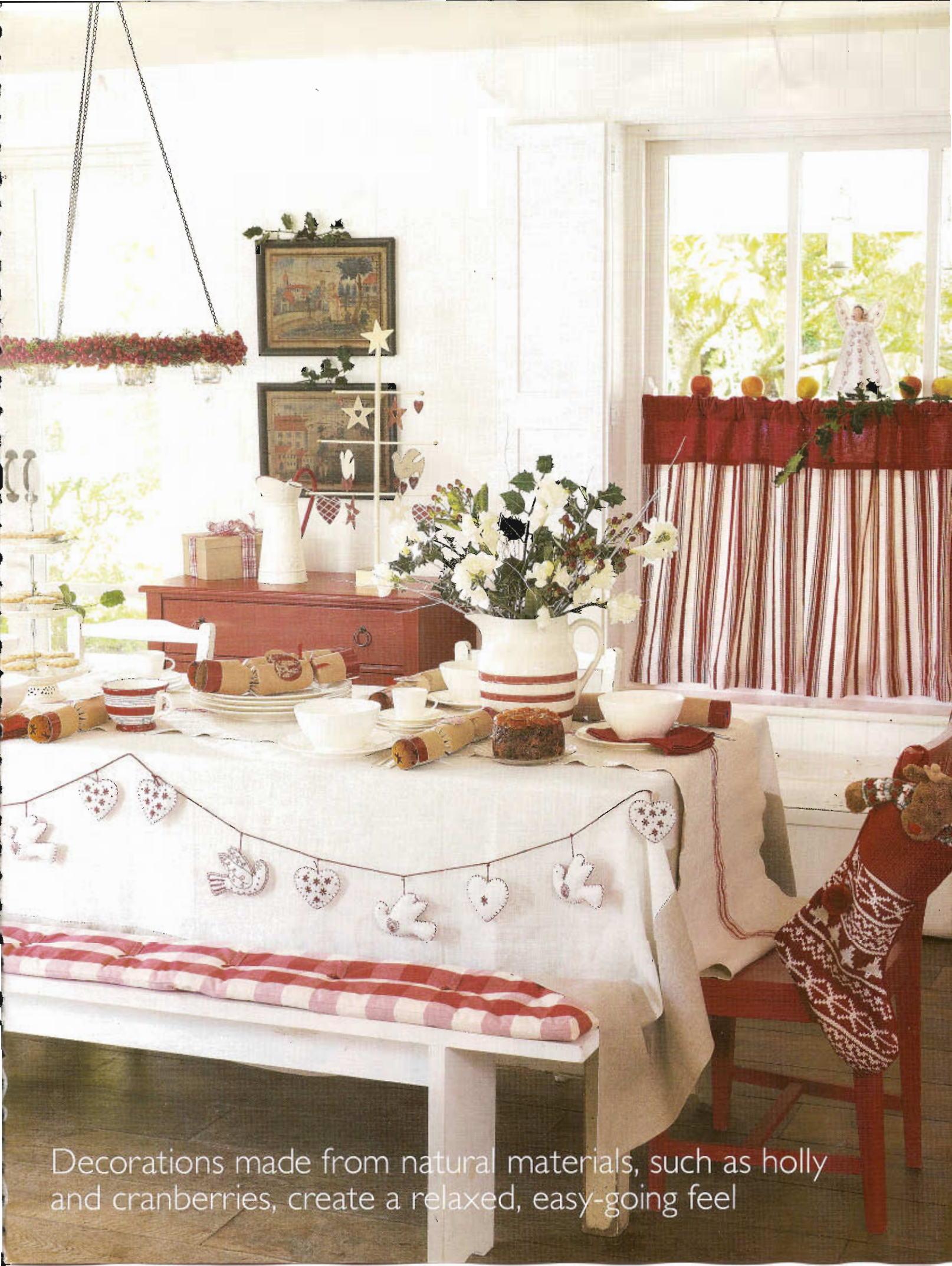
Decorations made from natural materials, such as holly and cranberries, create a relaxed, easy-going feel