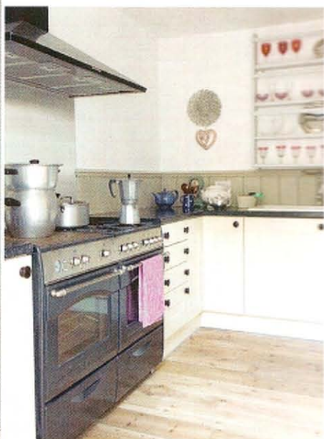
Left The enlarged sitting room overlooks the tiny internal courtyard. Above The multi-functional Rosières range cooker gives significance to this cottage-sized kitchen. By keeping the walls free of cupboards, José has made the room appear more spacious. The walls are clad to dado height with reeded panelling from Scumble Goosie which has been painted in Old White by Farrow & Ball.