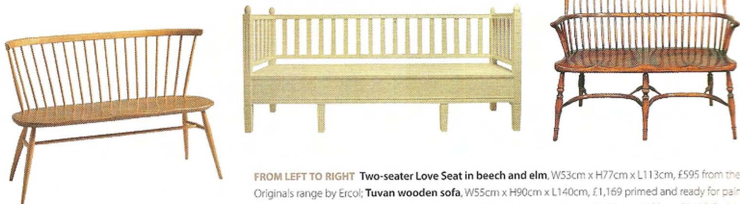
FROM LEFT TO RIGHT Two-seater Love Seat in beech and elm, W53cm x H77cm x L113cm, £595 from the Ercol Originals range by Ercol; Tuvan wooden sofa, W55cm x H90cm x L140cm, £1,169 primed and ready for painting or £1,477 painted, Scumble Goosie; Ash Windsor stickback settee, W46cm x H103cm x L109cm, £1,415, Batheaston

SEATS Open backrests give these seats a lighter look in smaller rooms