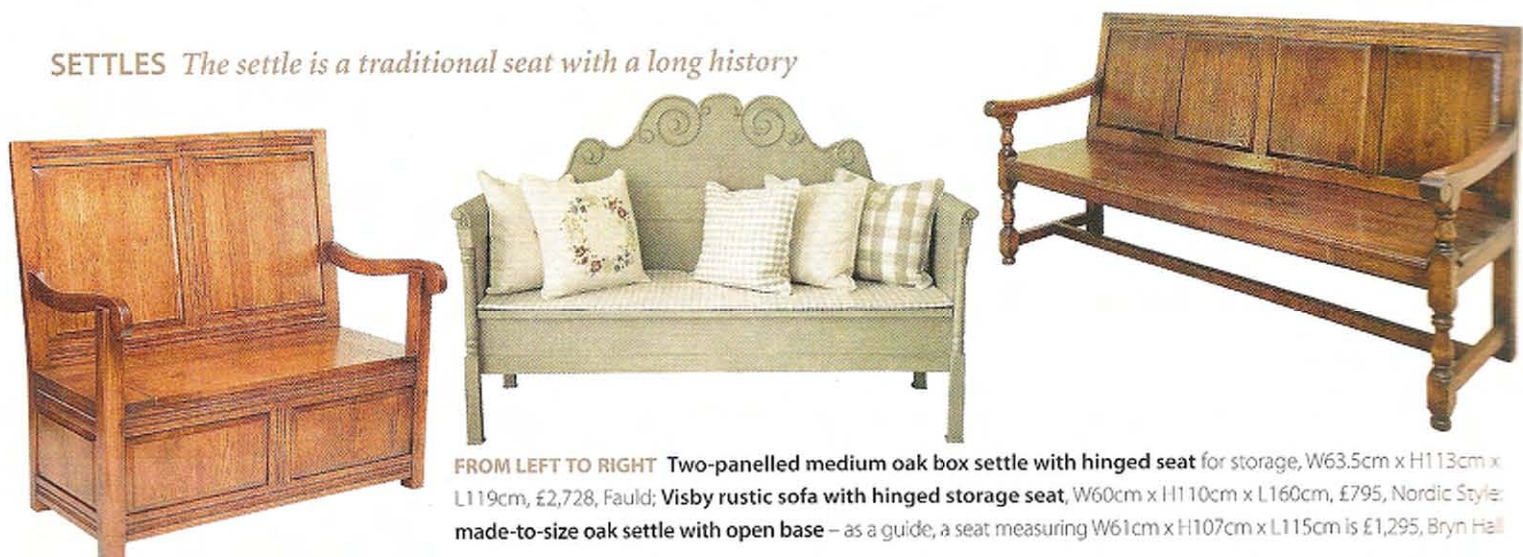
FROM LEFT TO RIGHT Two-panelled medium oak box settle with hinged seat for storage, W63.5cm x H113cm x L119cm, £2,728, Fauld; Visby rustic sofa with hinged storage seat, W60cm x H110cm x L160cm, £795, Nordic Style; made-to-size oak settle with open base – as a guide, a seat measuring W61cm x H107cm x L115cm is £1,295, Bryn Hall

SETTLES The settle is a traditional seat with a long history